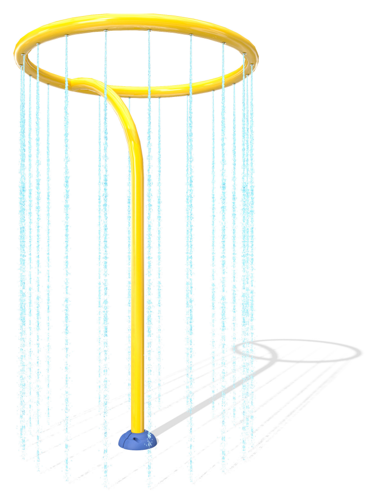
*The product shown in the image may differ from the actual product sold.