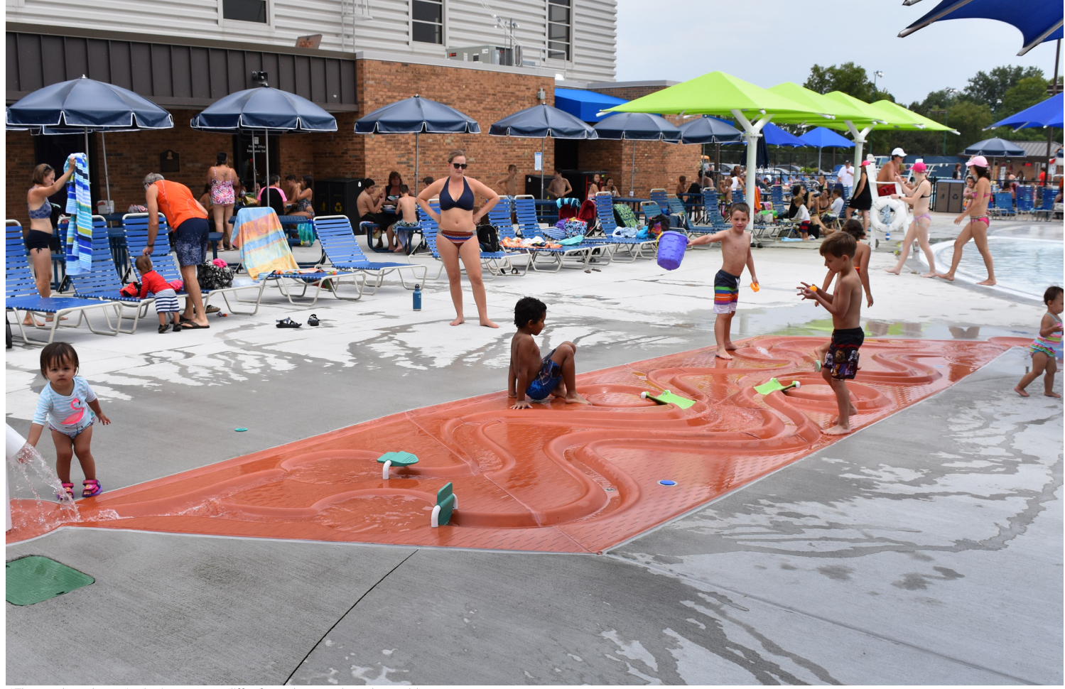
Ideal age group: for all ages