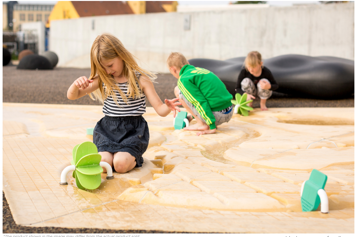
Ideal age group: for all ages